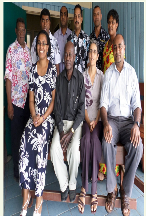
Team With ASYCUDA team in Honiara

This esteem responsibility was received well by the members as they develop passion combine with sacrifice to enable a robust team that is taking over the development phase of ASYCUDA World in FRCA.