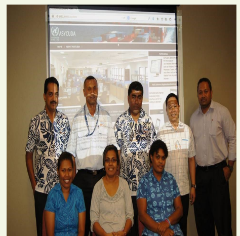
Launching of the ASYCUDA World Prototype.

Since then, there has been a continuity in the development process and also consultations with internal and external stakeholders and numerous trainings with recommended users.