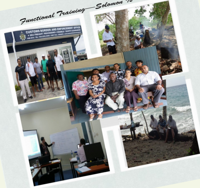
Functional Training - Solomon Is