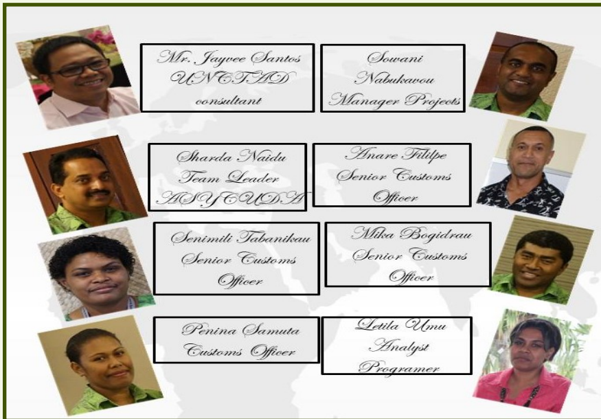
Project Team Members