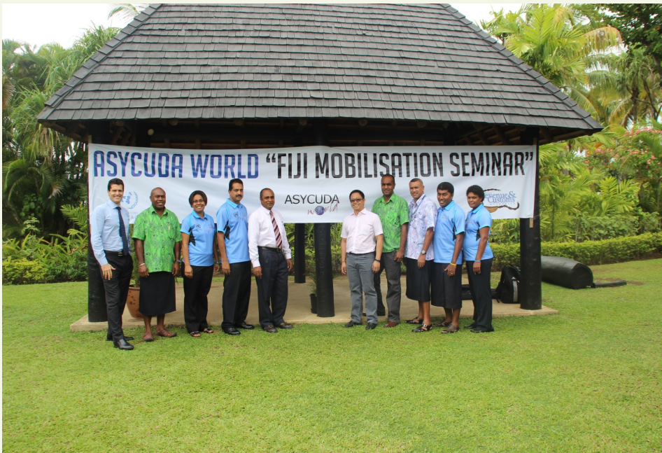
ASYCUDA World Project Team at the Mobilization Seminar held in Nadi