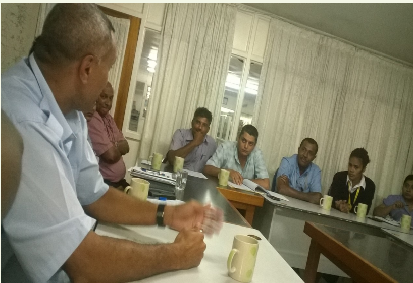
Consultations at Carpenters Shipping Conference Room.

The National Project Team holds numerous consultations with brokers and other stakeholders regarding process functionalities. These were very crucial discussions for the team to consider that all process covered in ASYCUDA-World comply with the administration legislations of the regulatory bodies involved, does not incur more cost to trade facilitations and creates efficiency in daily business dealings.