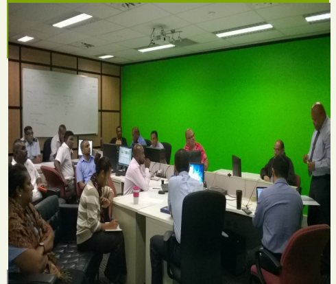
The workshop set up was an informal one to allow for open discussions among participants

The objectives were fulfilled as it led to final touch up and enable a successful logical cycle of the system itself.